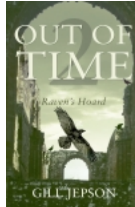
Out of Time 2:Raven's Hoard