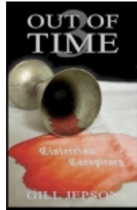
Out ofTime 3The Cistercian