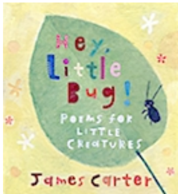
Hey, Little Bug! Poems for Little Creatures without rhymes from Zephaniah to Agard