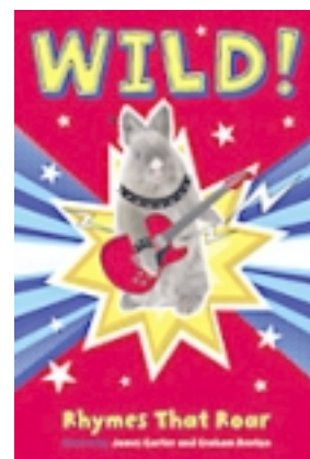
Wild! Rhymes That Roar