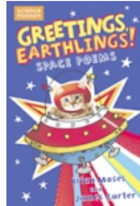
Greetings, Earthlings! (with Brian Moses)